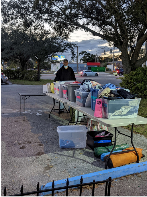
The Resource Table