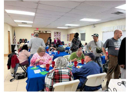
Some of the people that are part of The Table community.